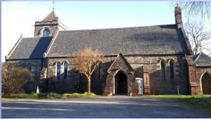
Holy Trinity Church, Dunoon