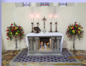
The Christmas Altar