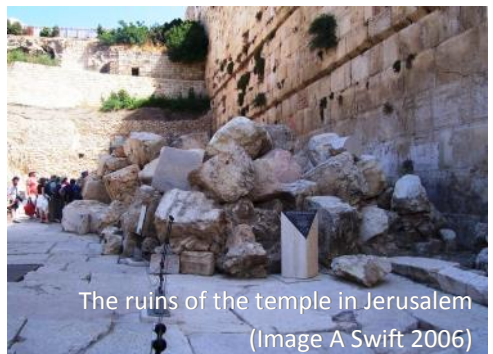
The ruins of the temple in Jerusalem (Image A Swift 2006)

Jesus, teaching his disciples, foresees the destruction of the Jerusalem temple (image below of the rubble today), and tells them that the world is a danger-