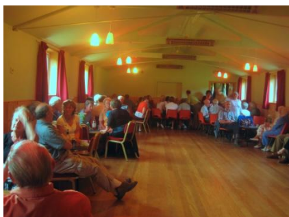
The Ceilidh at Uig Hall